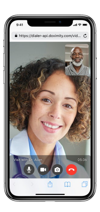
After tapping the 'Join Video Call' button you will be brought into the video call room where your doctor will meet you.