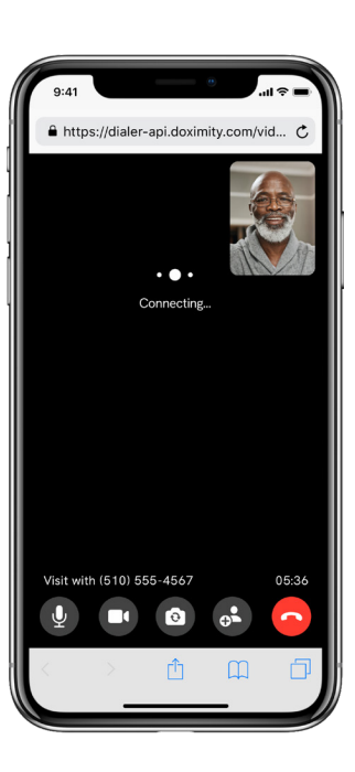
Next you'll see your video preview. Tap 'Join Video Call' and you'll be brought into the video call room.