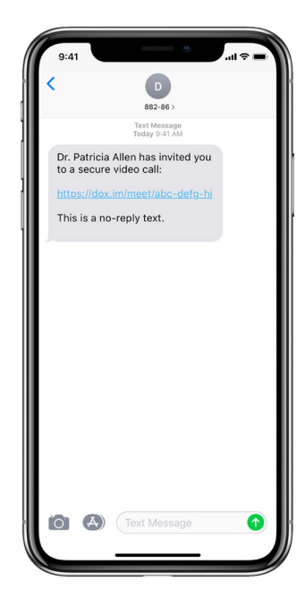
You will receive a text from an 882-86 short phone number inviting you to a video call.